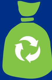
a plastic bag